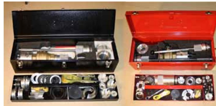
Easily fits in a tool box